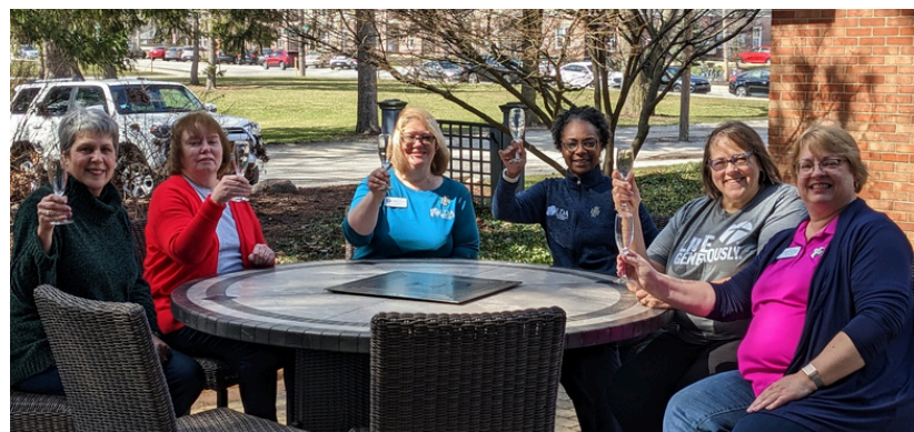
LDA Staff raise a glass in thanks for new outdoor patio furniture made possible by a grant from the Valparaiso University Guild and a gift from a generous donor.

I have treasured the LDA's partnership with Valparaiso University in so many ways over the years, and I look forward to the good work we can continue to do together in God's mission field.